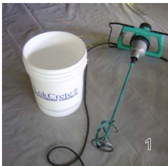
Auger Style Mixing Paddle