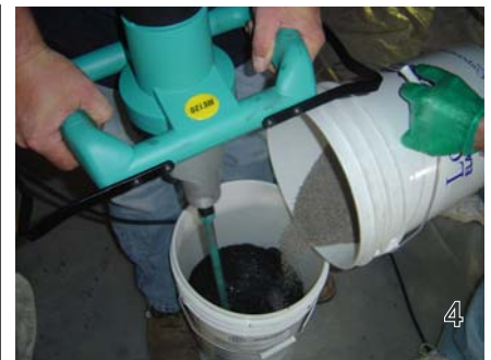
Slowly add aggregate and blend 3 minutes